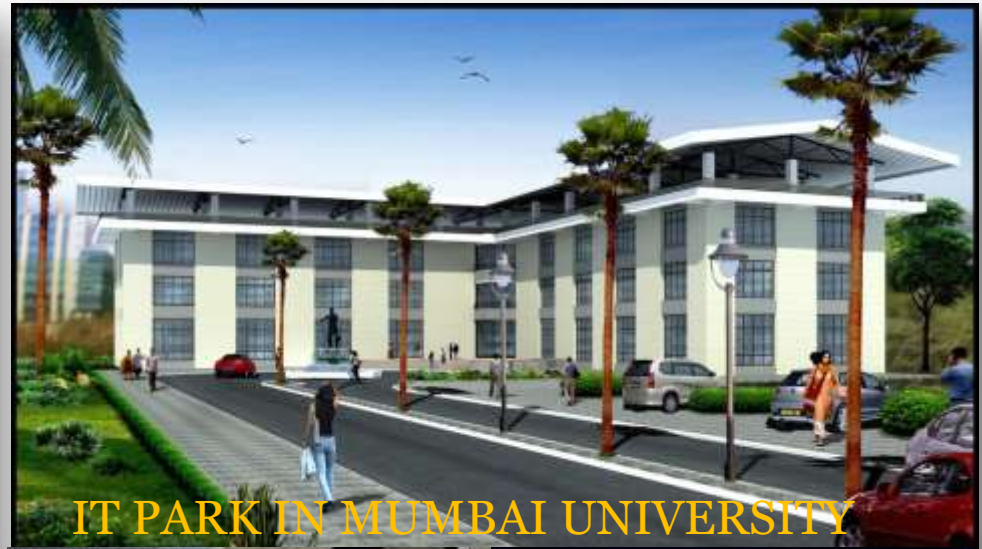
IT PARK IN MUMBAI UNIVERSITY