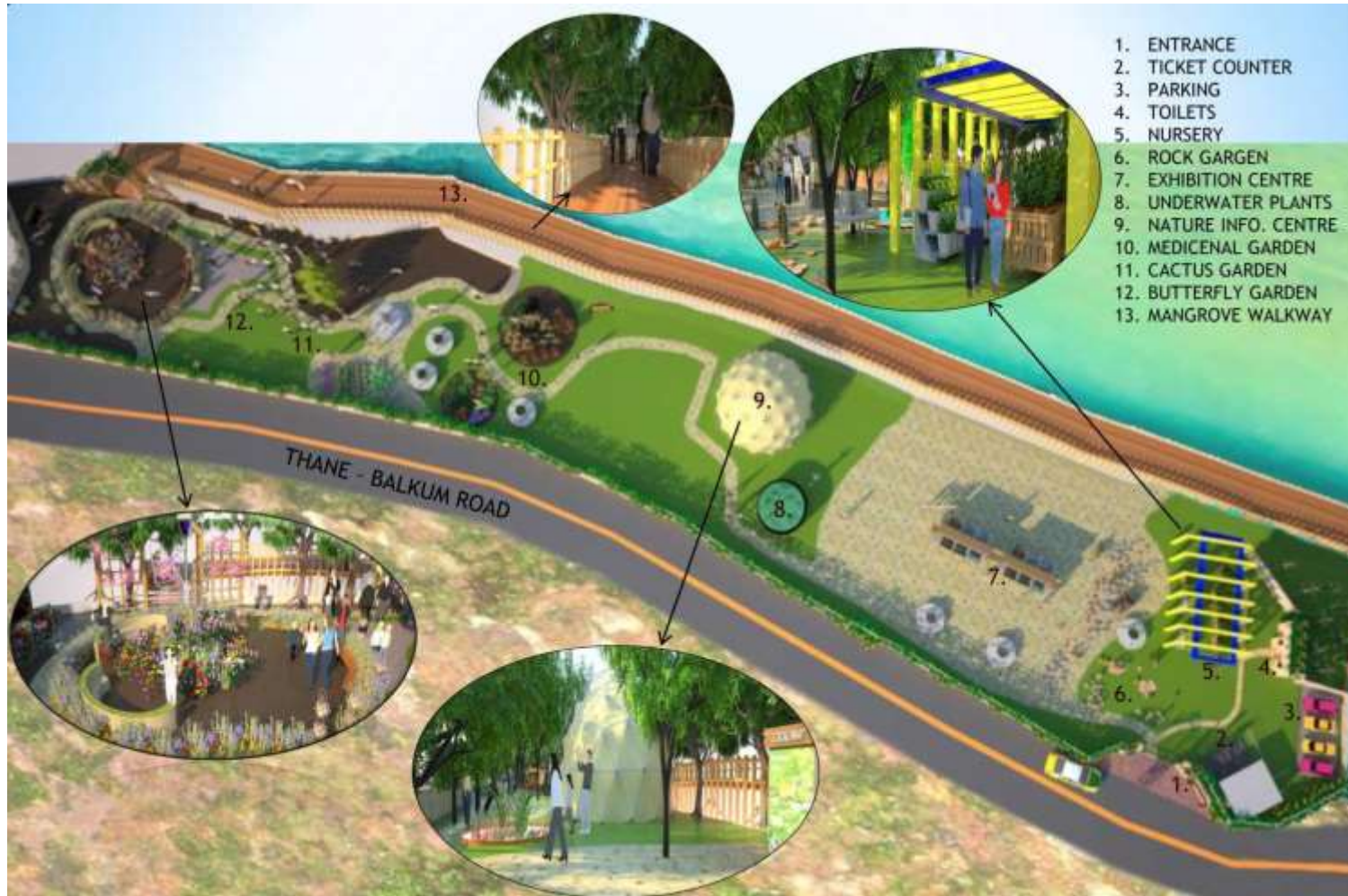
BIODIVERSITY PARK AT THANE CREEK