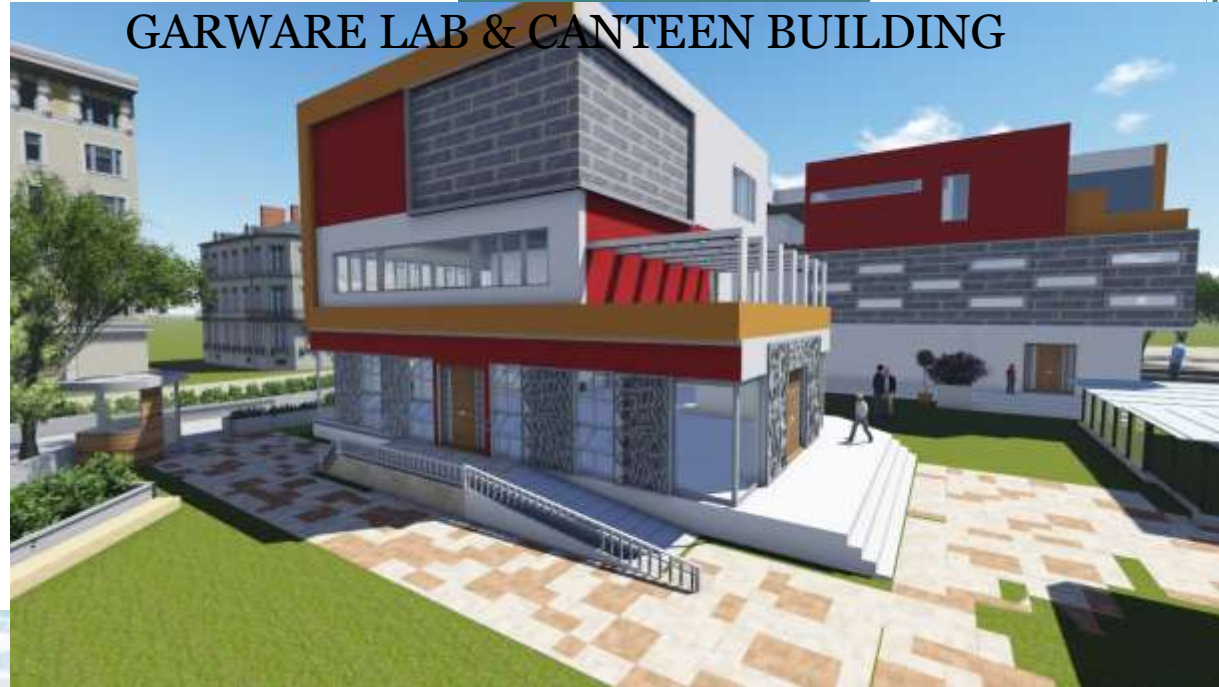
GARWARE LAB & CANTEEN BUILDING