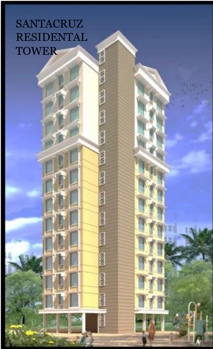
SANTACRUZ RESIDENTAL TOWER